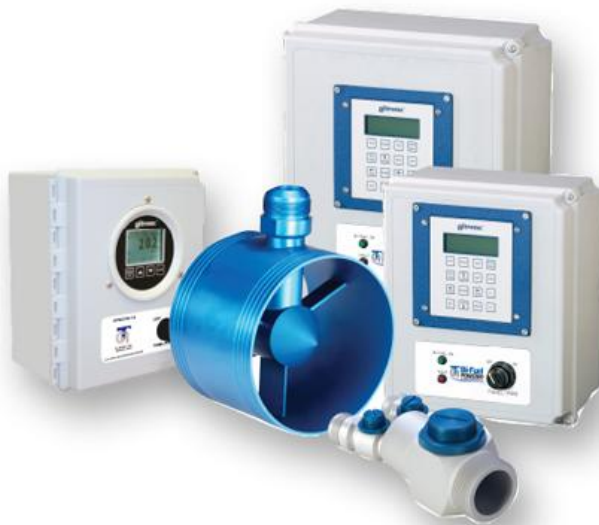
Bi-Fuel Control System Components

Natural gas turbine generators typically cost twice as much as comparable diesel units. With the Bi-Fuel System, you get the power of diesel and most of the benefits of natural gas operation for a price that is competitive with a diesel only unit.